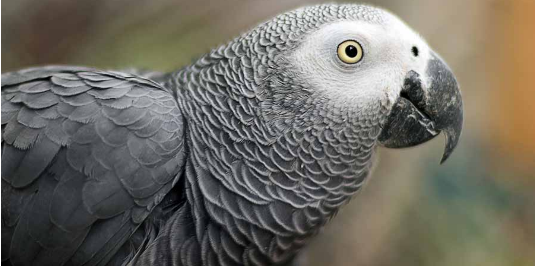
Grey parrot ( Psittacus erithacus )

I come from Israel, namely from the kibbutz community - an agricultural settlement that farms in the form of collective ownership. All people there live together, work for each other and help each other. I worked there with cows and in the fields, my father