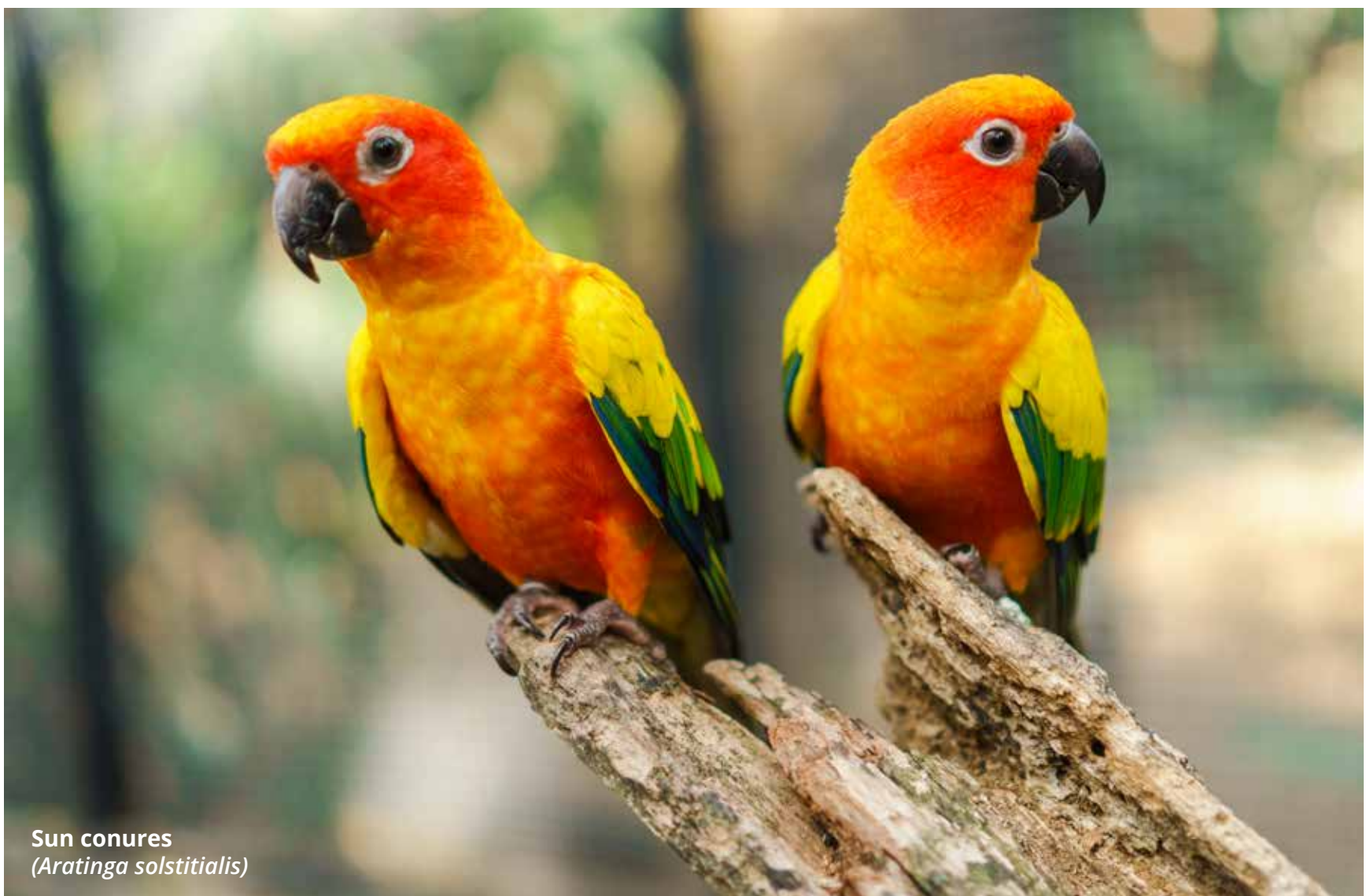
Sun conures ( Aratinga solstitialis )

Many of the additives that people offer their birds are not necessary if they provide a balanced diet. The important exception to this is calcium. As a general rule, my own birds receive all the nutrients necessary from their diet – with this exception. My bird cupboard is never without calcium supplements – liquid and powder – made specifically for birds.