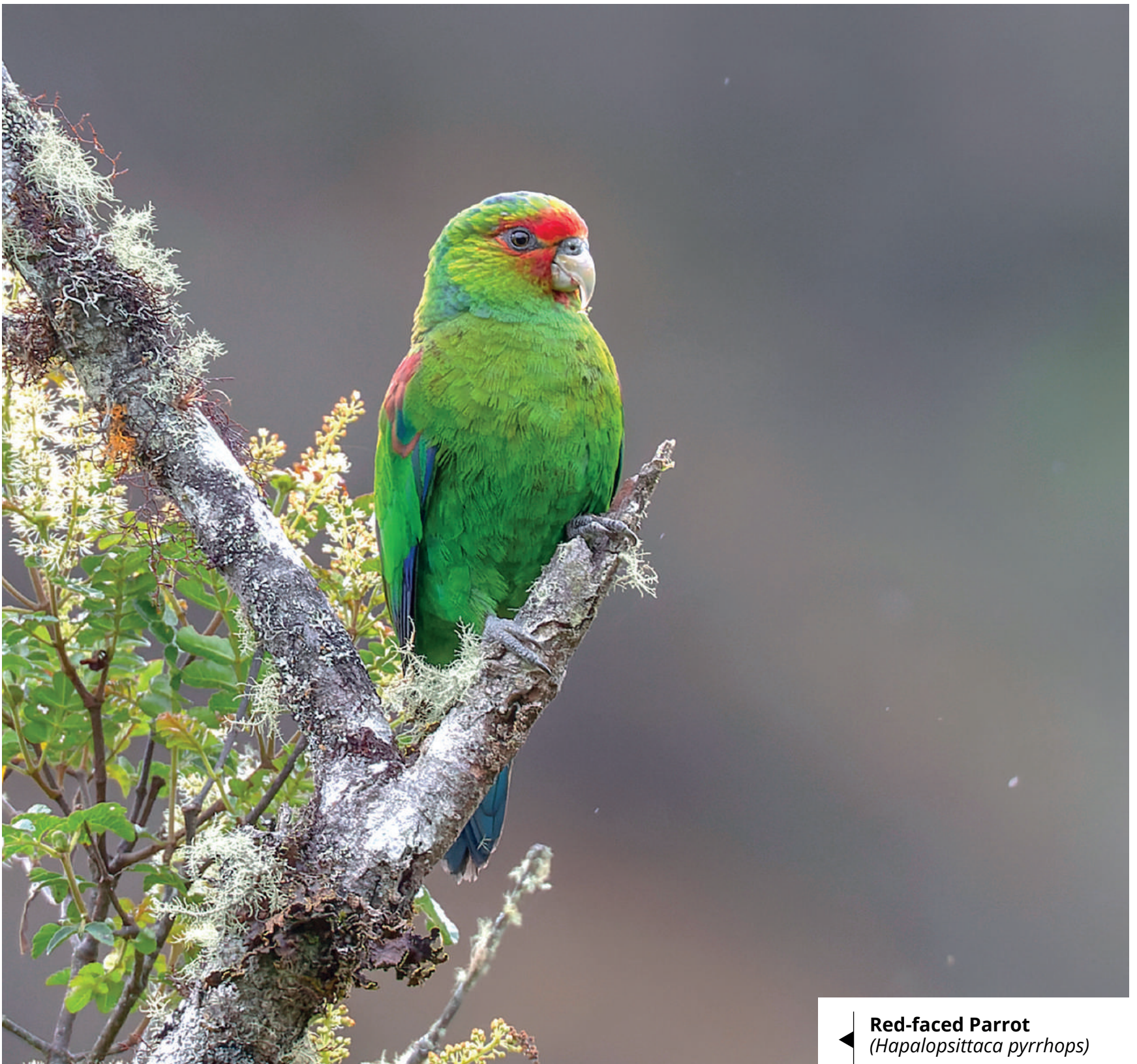
Red-faced Parrot ( Hapalopsittaca pyrrhops )