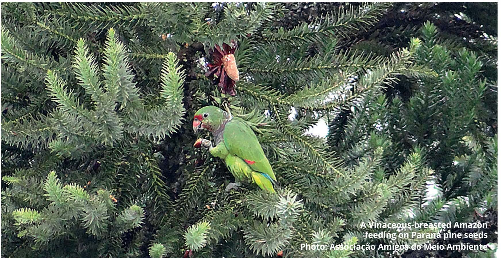
A Vinaceous-breasted Amazon feeding on Paraná pine seeds